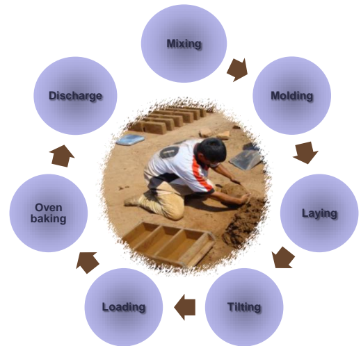
Figure 1. Handmade brick making process.

Antioxidant capacity was found diminished in occupationally exposed individuals in comparison to a similar, non-exposed group.